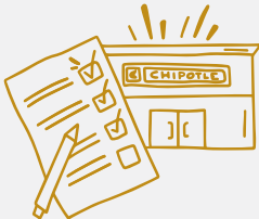
RESTAURANT INSPECTIONS P. 61